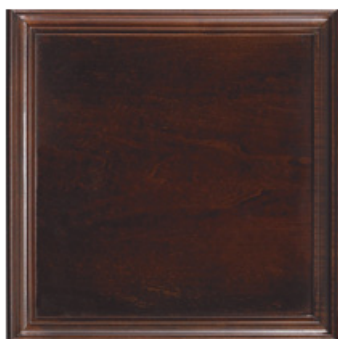
C7: CASHMERE Like a treasured cashmere scarf, the warmth and elegance of this high-sheen dark walnut finish adds a touch of class and refinement to any item.