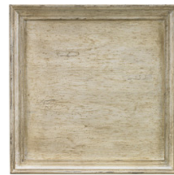
A3: BLANC A true artisan finish, created with multiple layers of ivory and slight sepia tones with wear-through and over glazes to create a special old-world look.