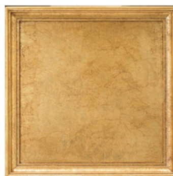
GL: GOLD LEAF A true hand-leafed finish; sheets of gold leaf are hand-applied over a frame, cured, then glazed over to soften the overall effect and create a beautiful patina.