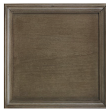
79: STONE Very clean grey-beige finish that reads through to the beauty of the wood grain beneath providing a handsome casual transitional feel.