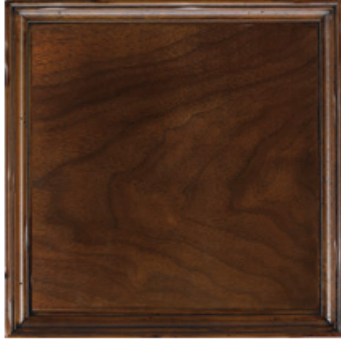
54: SOHO A rich medium value clear brown finish reminiscent of a lightly burnished antique pecan with a medium sheen level.