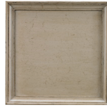
21: DOVE A soft patinated Belgian grey finish, hand burnished and detailed with a gently spattered antique glaze.