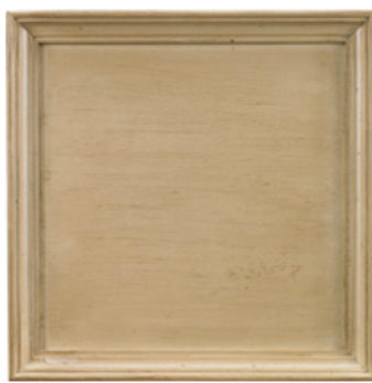
16: SILKWOOD A very artistic tawny beige finish in a color reminiscent of raw silk that has been very lightly spattered with moderate read through to the wood grain.