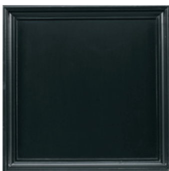
48: ESPRESSO A deep rich black traditional finish with a deep luster and a medium sheen level that has a very light rub-through along the perimeter edge.