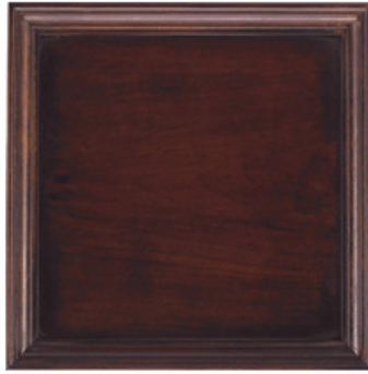
82: VERONA An elegant, dark rich coffee color that radiates the subtle undertones of its deep cordovan base with light spatter application.