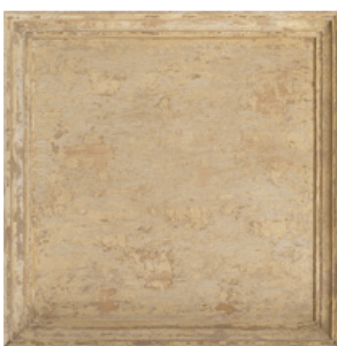
C4: COBBLESTONE * Interpreted from a Parisian antique, the sun-kissed amber-white tones and crusty texture of this finish resemble the well-worn cobblestone streets of a Provencal village.