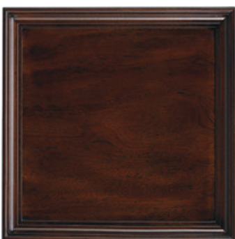
56: G2 A beautiful, clear, russet finish with a medium sheen, light burnishing and slight spatter affording a more casual easy to live with presentation.