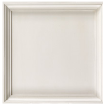
C9: WINTER WHITE Winter White is our opaque, clean white Sugar finish with an over-glaze to create strategically placed dry-brushing and shading to create the look of much loved but well worn vintage piece.