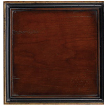
73: CONTINENTAL An antique, deep chestnut finish with russet undertones accented with aged black and gold accent striping and a light dusty wax.