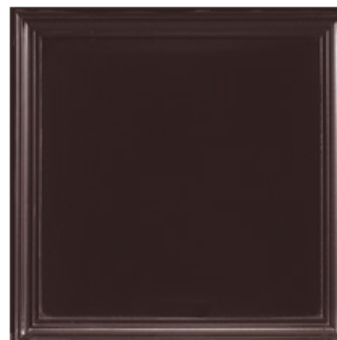
C8: CAFE NOIR The color of rich, dark Columbian coffee, Cafe Noir is a beautifully sleek very dark brown/black finish with a high sheen and no applied distressing.