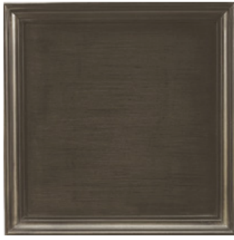
39: BLACK NICKEL A deep nickel-colored paint finish with very fine black brushing on top to resemble black nickel metal.