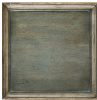
D7: AZURE Evoking the intense blue skies of the Cote d'Azur with creamy white & subtle golden accents and the hardware painted over as on a treasured antique. Available on 865-31 only.