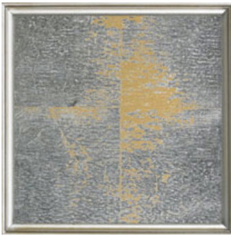
SG: SILVER LEAF WITH GOLD

Leaf finish created by applying gold painted ground color, hand-applying silver leaf sheets in a grid pattern on top of the paint, then wearing the edges to expose the gold.