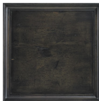
C3: MALABAR A wonderfully soft black finish with brown undertones.