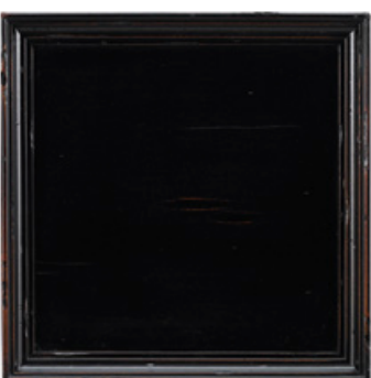
44: EBONY A rich rubbed-through black finish that highlights the underlying wood tones with a lustrous satin-like patina.