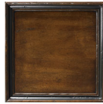
E2: SANTE FE A two-tone finish that combines a warm, earthy chestnut brown with black accents to create a classic casual look.