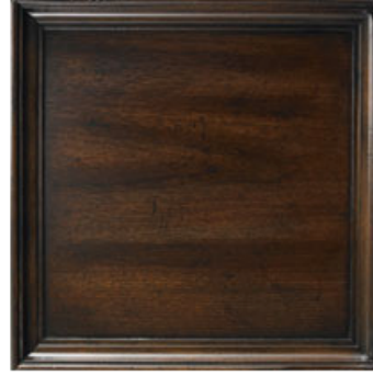
E3: SONOMA Evoking the casual modern lifestyle of the wine country, this rich deep brown finish features cowtailing and dry-brushed highlights.