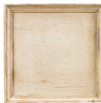
71: OLD WORLD A very labor intensive aged, antique white artisan painted finish designed to capture the look and feel of pieces well cared for over generations.