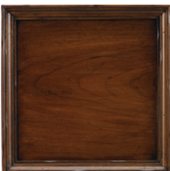
70: CARMEL A warm and inviting carmel colored wood tone enhanced with hand burnishing and spatter creating an ideal finish for rich casual lifestyles.