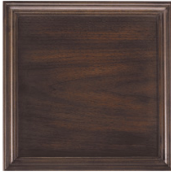
A1: MODERN WALNUT A rich, warm, high sheen brown finish that emphasizes the clarity and natural beauty of the wood beneath.