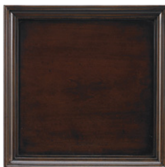
20: MAISON A rich hand-rubbed waxed dark walnut finish enhanced with hand burnished edges, cowtailing, and a light antique spatter.