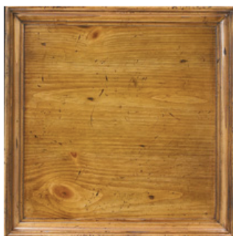
C2: HARVEST Ripe wheat stalks create an inviting dark golden hue which inspired our Harvest finish, especially developed to enhance the natural beauty of items crafted in pine and other naturally light-colored wood species.