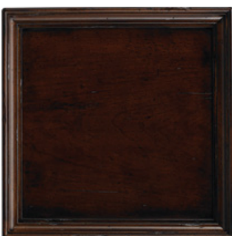
40: LOW COUNTRY A beautiful, relaxed, heavily aged deep walnut hand-burnished brown finish with light spatter adding antique low country charm.