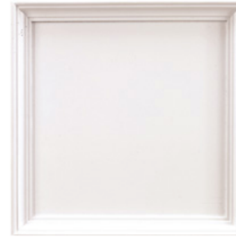
27: SUGAR An opaque, clean white finish with a very slight intermittent rub-through along the perimeter edge.