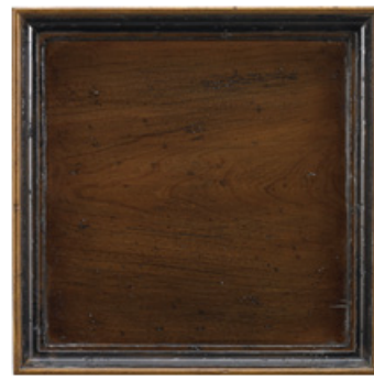
76: OXFORD A unique combination of a light aged pecan finish that has been hand-burnished, highlighted with aged gold and charbrown accent striping where applicable.