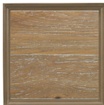
B3: CHAMOIS SANDBLASTED Sandblasted for a natural weathered look. Chamois has white hang-up and distressing to highlight the rough-hewn texture. Only available on solid Ash or Oak.