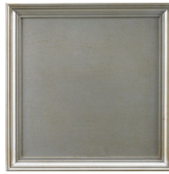
03: PLATINUM A metallic finish with an underlying base of silver and very subtle hand-padded gold overtones giving a platinum patina.