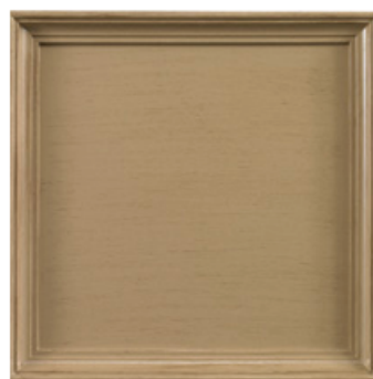
C6: KHAKI Reminiscent of a classic pair of khaki pants, our Khaki finish has a painted look created with toners to subtly allow the wood grain beneath to telegraph through.