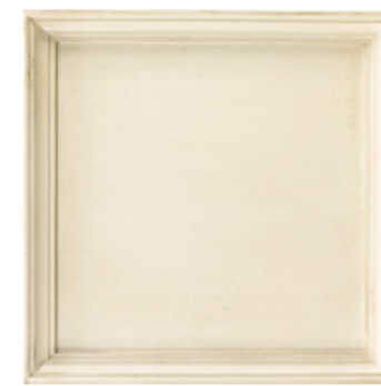
34: WASHED LINEN A very pleasing clean, off-white finish with a very light rub through providing the natural look of washed cotton or flax.