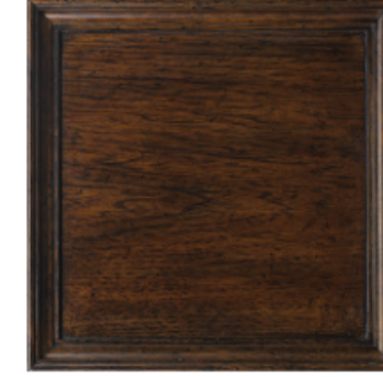
F1: TOSCANA A rich medium brown finish with a high sheen finish, craftsman applied cowtailing, hand-burnishing and slight splatter offering a more casual easy to live with application.