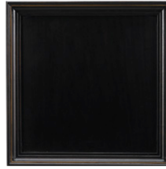
53: SABLE A rich dark brown finish with excellent clarity. A handsome Bronze accent stripe is added to the Stratos (530) collection to complement and enhance its richness