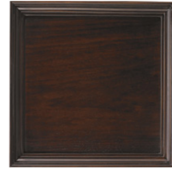
65: WALNUT A sophisticated satin finished walnut brown with russet undertones enhancing the natural beauty of wood.