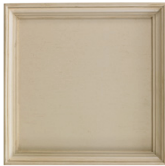
66: WALNUT IVORY A clean fresh linen lacquer paint finish with a very light spatter that provides a transitional opportunity for any wood species.