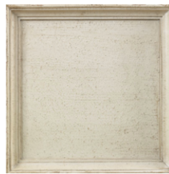
F2: TALC A creamy white textured finish featuring the use of gesso to create the one-of-a-kind old world look. Each application will vary in texture and appearance due to the incredible handwork.