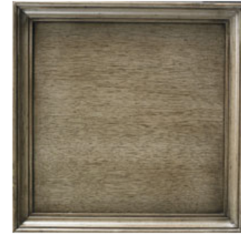
E4: SMOKE Warm, medium grey finish with brown undertones and light dry-brush aging around the edges which allows the rich grain pattern of the wood beneath to show through.