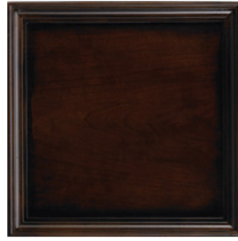
07: NEWPORT An elegant clear medium brown finish with very light aging and the subtle burnishing of a well cared for antique.