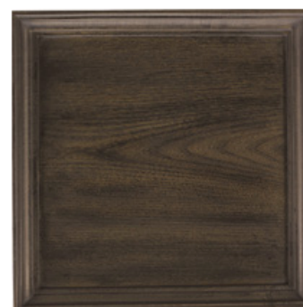
A2: MODERN ELM Developed to take advantage of the striking grain pattern of elm veneers, this warm greyish-brown finish creates a soft, transitional appearance.