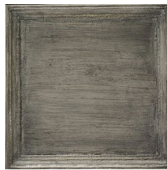
C5: BASALT Inspired by the color and texture of the dark grey, rough texture of basalt stone.