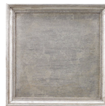
PL: PLATINUM LEAF A true leafing process, silver leaf sheets are hand applied to the wood frame, cured and glazed over to create a beautiful Platinum leaf finish.