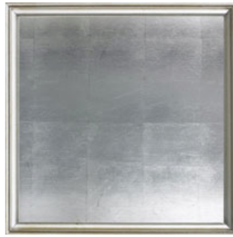
SS: SILVER LEAF SQUARES

Leaf finish created by applying gold painted ground color, hand-applying silver leaf sheets in a grid pattern on top of the paint, then wearing the edges to expose the gold.