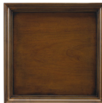
13: LANCASTER Medium brown satin finish with hand applied burnishing and light visual distressing reminiscent of a well cared for 19th century antique.