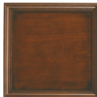
42: COGNAC Rich medium brown earth tones accentuate this bold and elegant finish with the depth and satiny sheen of fine cognac.