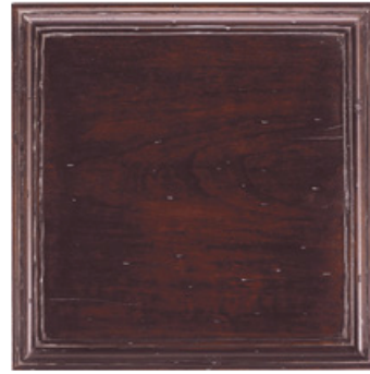
06: VINEYARD A deep aged brown hand-burnished wood finish, hand-rubbed to provide the deep luster of a well aged antique.