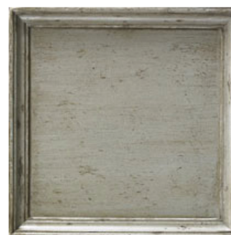
E5: FRENCH BLUE Aged like a fine vintage Court piece, this is a beautiful grey-blue paint with hints of silver, dry-brushing and glazing.