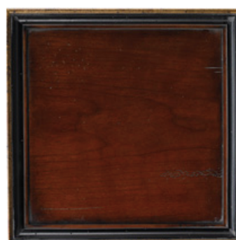
77: ESTATE An aged antique chestnut finish with wonderful russet undertones. This is the base finish for the striped Continental finish.