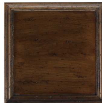
46: CAMBRIDGE A unique combination of a light aged pecan finish that has been hand-burnished. This is the base finish for the striped #76 Oxford.