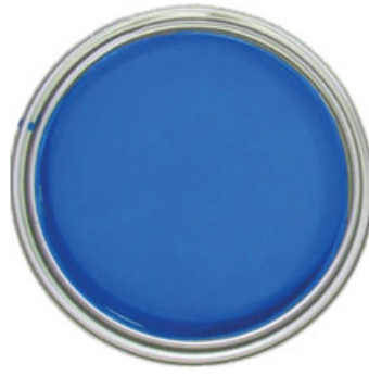
CM: COLOR MATCH Add your favorite paint color to our furniture with Color Match. With the Color Match program, choose a paint color, send us a paint finish chip, and we will match it to finish your custom order. With thousands of colors to choose from, it has never been easier to incorporate your unique style.