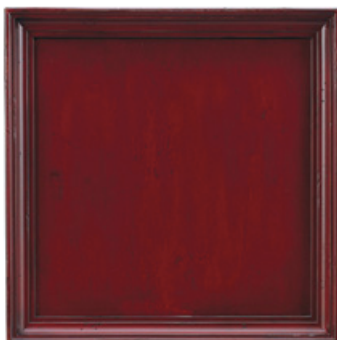
43: ANTIQUE RED A rich deep red finish that has been hand burnished to add aging and lightly spattered to add a true antique value.