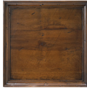
C1: VINTAGE BROWN A warm, deep chestnut brown finish with craftsmanlike hand applied dry-brushing and shading to create the look of much loved but well worn vintage piece.