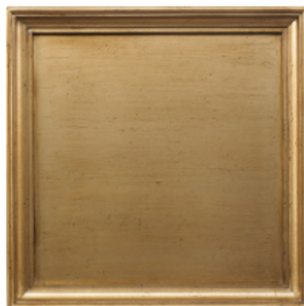
F4: BULLION A gold paint with a glazed appearance to emulate the beauty and appearance of gold leafing.