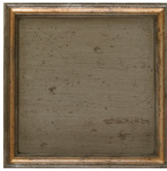
E1: FRENCH BLUE WITH GOLD Our French Blue finish accented with Antique Gold striping.